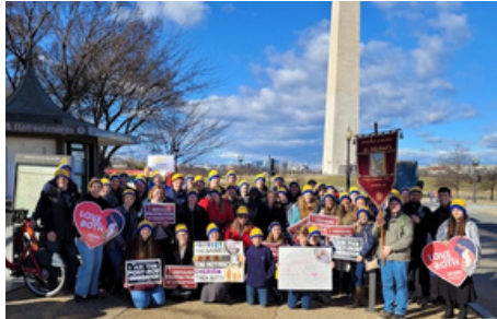
St. Michael's at the March for Life in Washington DC.