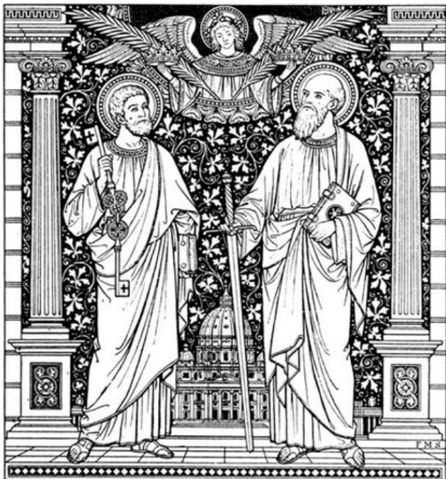
Saints Peter and Paul (Feast June 29)

The overturning of Roe v. Wade by the SCOTUS is a great victory for life! Let us make extra prayers and sacrifices this week in gratitude to God for answering our prayers in this matter. Nearly 50 years of prayers and sacrifices! We still have a long way to go in protecting and defending the sanctity of life in this country but let us take a moment to give thanks for this victory.