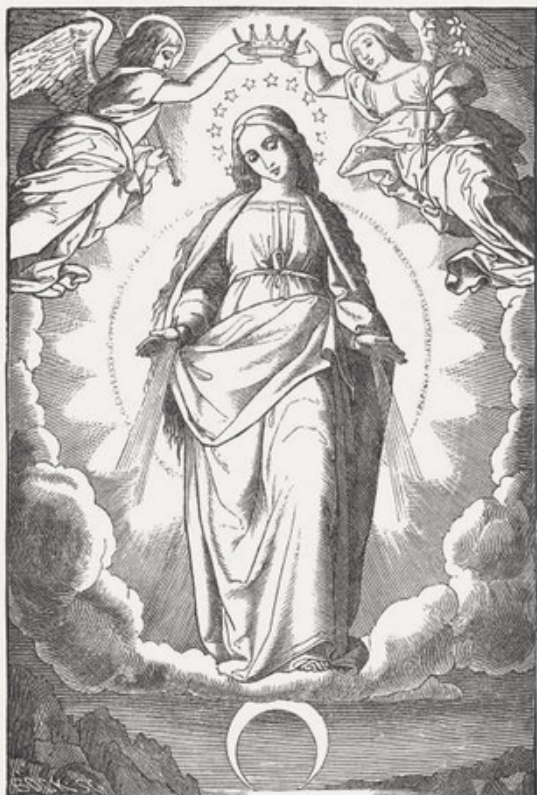
Our Heavenly Queen and Mother

May God's blessing and graces be upon all of the mothers of St. Michael's. Thank you for all you do for us here at the parish, especially for the Catholic formation you provide for your children and for the example and encouragement you provide for all here.