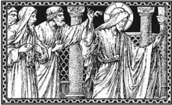
And He hid Himself, and went out of the Temple

O Jesus, through the Immaculate Heart of Mary, I offer Thee all my prayers, works, joys, and sufferings of this day, for all the intentions of Your Sacred Heart, in union with the Holy Sacrifice of the Mass throughout the world, in reparation for my sins, for the intentions of all my family and friends, and in particular, for the intentions of the Holy Father. Amen.