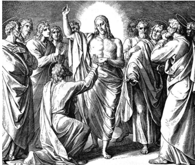
Christ Appears to the Apostles