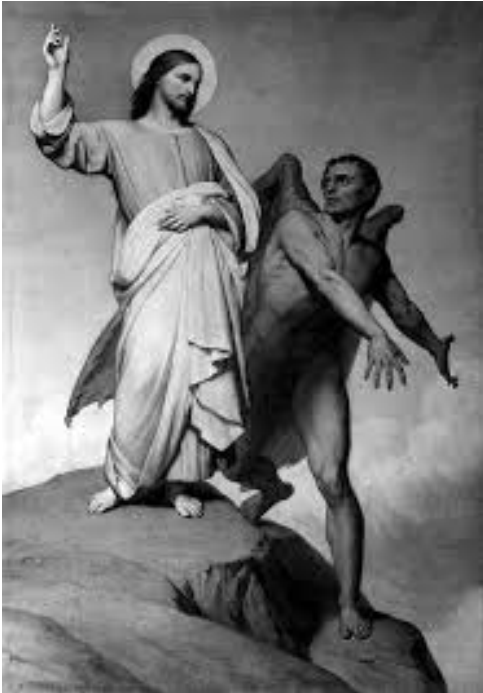
Temptation of Christ in the Desert