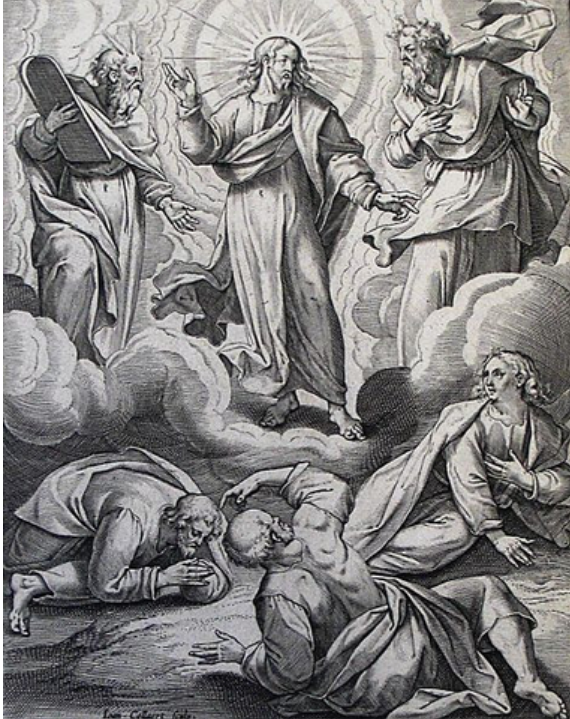
The Transfiguration of Our Lord